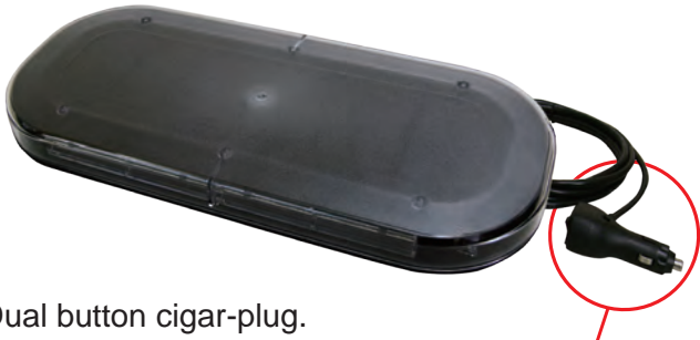
Dual button cigar-plug.